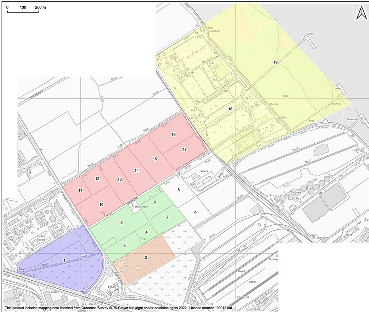
Figure 2: Humber Zero Bird Survey Area 2021 – 2022